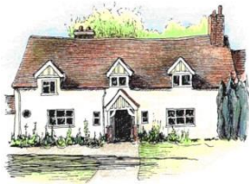
The Old Crown, West End